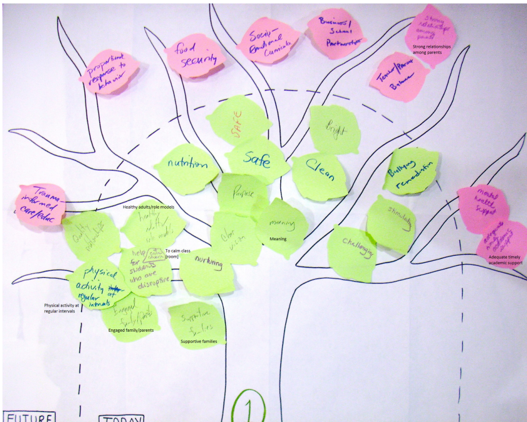
Figure 3. Policymakers' Visual Representation of What a Healthy School Looks Like Today (green) and What It Could Look Like in the Future (pink)

The research team conducted phone interviews to expand upon initial findings from the focus groups. The research team also conducted phone interviews with educators. Student interviews tended to be shorter, lasting 15 to 30 minutes, whereas policymaker and educator interviews were longer, lasting 30 to 60 minutes. Participants (and their parents, if applicable) provided written consent/assent prior to the focus group discussions and verbal consent/assent prior to the telephone interviews. All interviews, except those conducted with state legislators and legislative staff, were audio-recorded with participant consent/assent and transcribed from the recordings shortly after they took place.