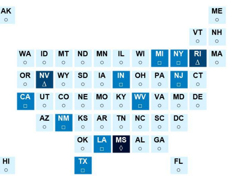
Figure 1. Thirty-nine states do not cover employee wellness in state education policies. Comprehensiveness of policies promoting employee wellness in schools, by state.

This map shows states that have [\diamond] comprehensive (1), [\varDelta] moderate (2), [\Box] low (9), [\circ] and no (39) coverage of employee wellness topics in statutes and regulations governing education.