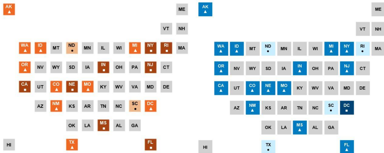
Figure 2a and 2b. State law (left) and public school district (right) comprehensiveness of health services topics in policy.

These maps show the proportion of states (left panel) and districts (right panel) in each of the 20 selected states that have [■] comprehensive (state panel: 8; district panel: 1), [▲] moderate (state panel: 10; district panel: 15), [◼] low (state panel: 2; district panel: 4), or [-] no (state panel: 0; district panel: 0) coverage of health services topics in state and district policies, respectively. For this report, only the 20 states represented with colored squares were studied (at the state and district levels); states shown in gray were excluded from this analysis.